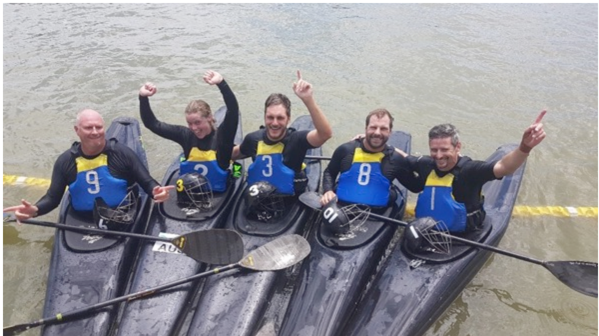
ACT Open at the Australia Day competition (Adelaide)

Now, we are back to Lakeside Leisure Centre for some warm, chlorinated watery goodness, with the 2019/2020 Summer Series to commence in Canberra in October or November.