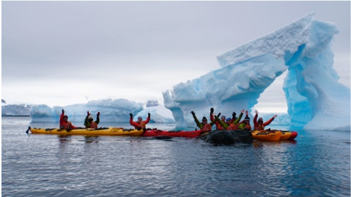
Kayak family, Detaille Island.

We have twelve days to explore the Antarctica Peninsula. A double rainbow frames the Beagle Channel as we depart Puerto William, Chile, on board the Polar Pioneer , an icebreaker whose Russian