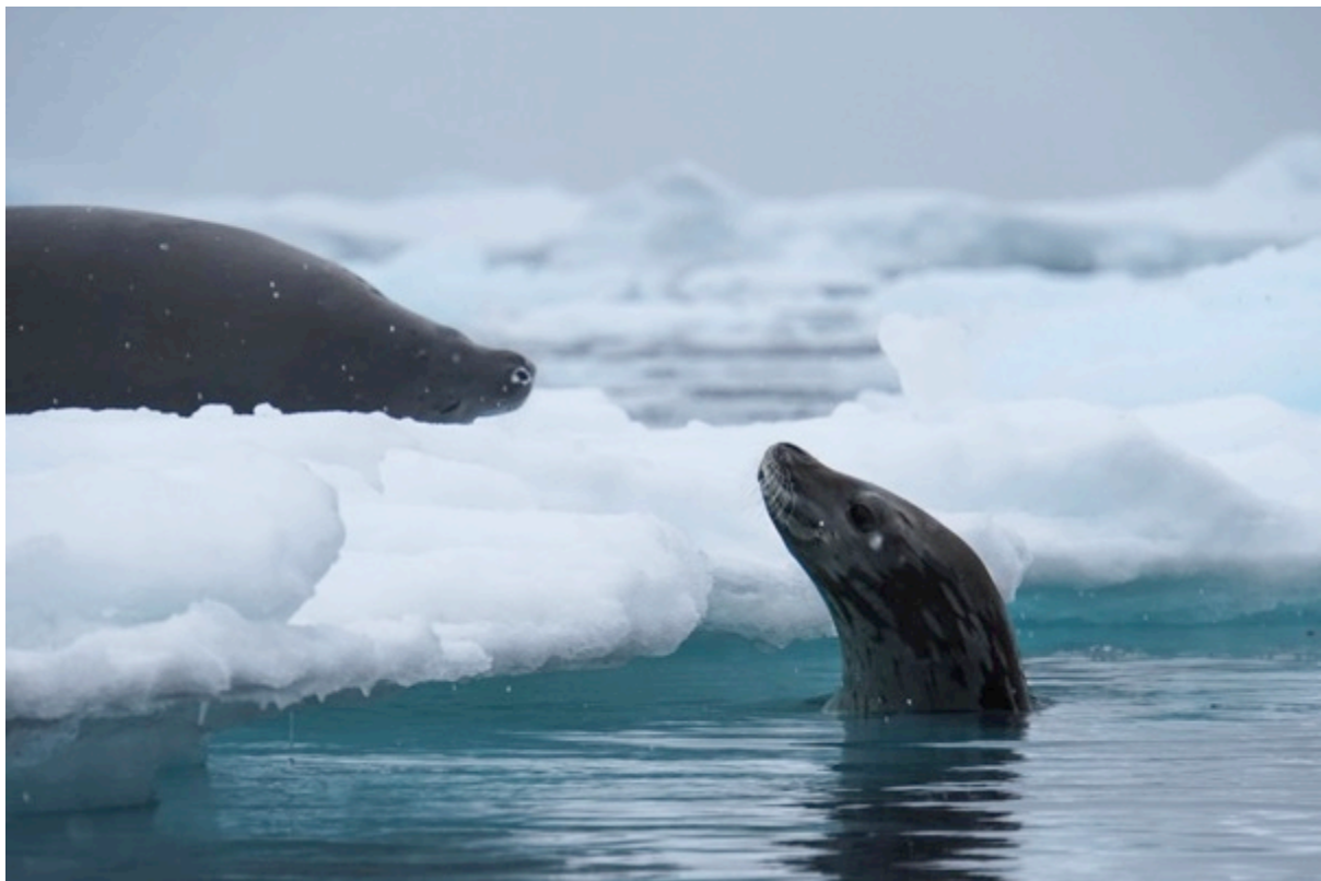
Paradise Bay, seals.