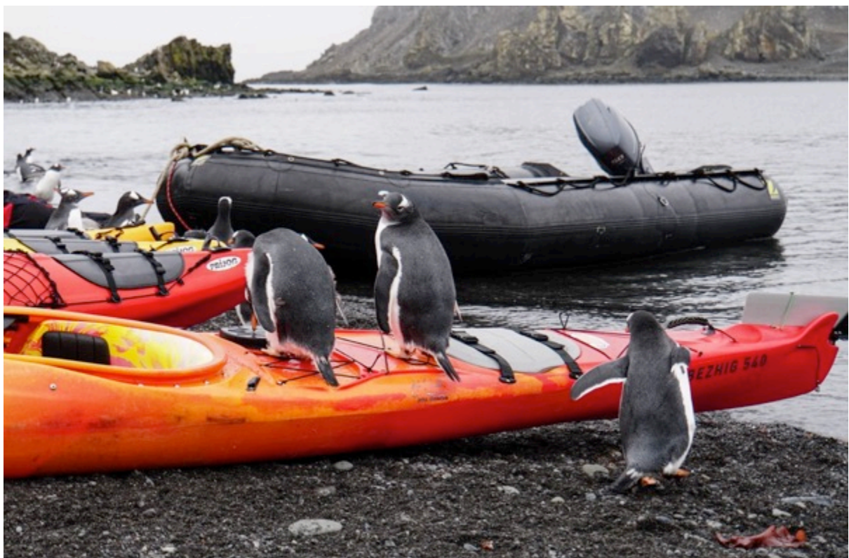
Aitcho Island, Gentoo penguins.

After a relatively calm crossing of the Drake Passage, including sighting a Black-browed Albatross, we arrive at Aitcho Island. Gentoo penguin chicks are ready to fledge: moulting elders await feather regrowth. Fitted out in dry suits and life jackets our small band of kayakers takes to the water. Each day we explore spaces beyond the reach of ship and Zodiacs. We see colonies of gentoo, chinstrap and Adélie penguins; raft-up and glide towards breaching humpback whales; land on an ice-floe; kayak through brash ice, around dynamic icebergs, along a glacier face, among rambunctious adolescent male fur seals in the caldera of Deception Island; listen to the thunderous calving ice; note the brilliant coloured lichens. We cross the Antarctic Circle, 66°33.66' and pay tribute to Captain Cook's January 1773 Resolution and Adventure crossing. We circumnavigate Detaille Island and pause among curious crabeater seals. We're in uncharted waters, so, following the tradition of earlier explorers, our log records the name, 'Daniel's Cove', after our guide.