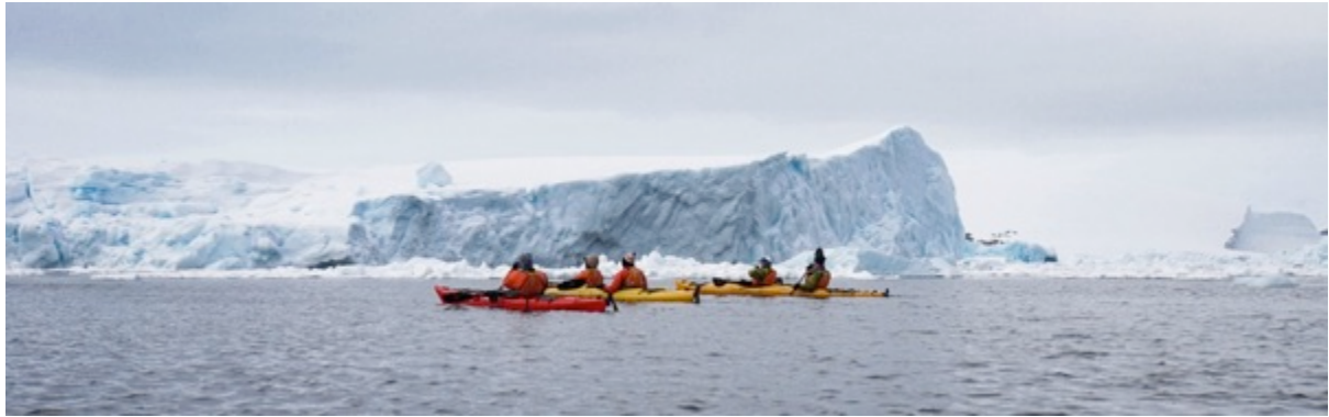
Fish Islands: Diane Bell and Margy Burn (middle kayak).

After a relatively calm crossing of the Drake Passage, including sighting a Black-browed Albatross, we arrive at Aitcho Island. Gentoo penguin chicks are ready to fledge: moulting elders await feather regrowth. Fitted out in dry suits and life jackets our small band of kayakers takes to the water. Each day we explore spaces beyond the reach of ship and Zodiacs. We see colonies of gentoo, chinstrap and Adélie penguins; raft-up and glide towards breaching humpback whales; land on an ice-floe; kayak through brash ice, around dynamic icebergs, along a glacier face, among rambunctious adolescent male fur seals in the caldera of Deception Island; listen to the thunderous calving ice; note the brilliant coloured lichens. We cross the Antarctic Circle, 66°33.66' and pay tribute to Captain Cook's January 1773 Resolution and Adventure crossing. We circumnavigate Detaille Island and pause among curious crabeater seals. We're in uncharted waters, so, following the tradition of earlier explorers, our log records the name, 'Daniel's Cove', after our guide.