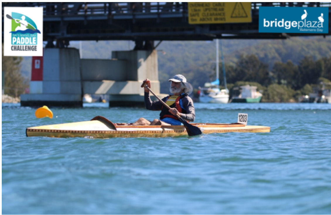
I might look relaxed, but in fact I am trying to ease the pain in my back caused by the effort of dealing with waves and powerboat wake