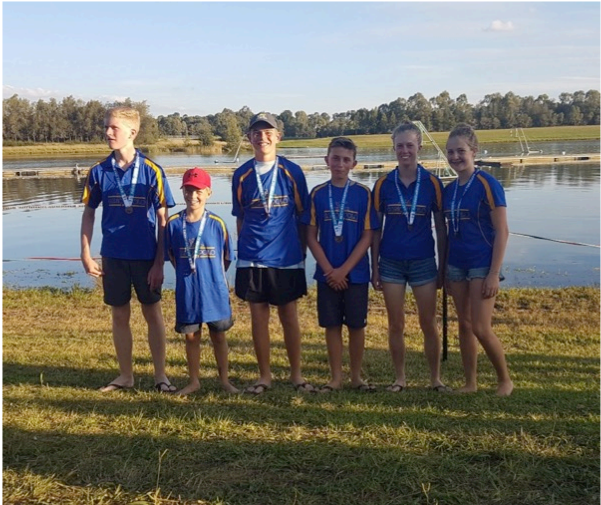
Nationals 2019—ACT Junior Team