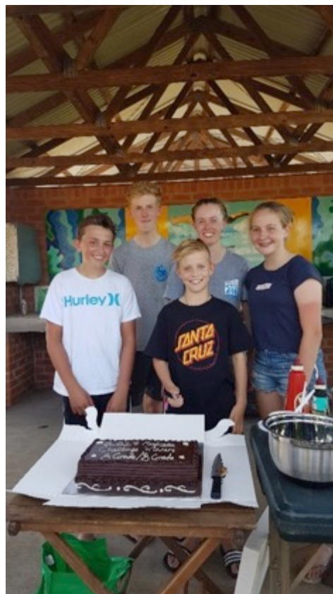
Mudcake Challenge - ACT Junior Team