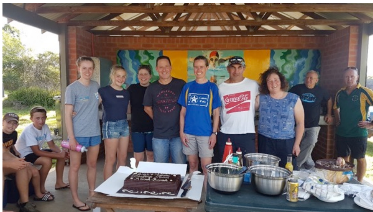
Mudcake Challenge—ACT Open

The National and Oceania Championships were run across the Easter and ANZAC Day weekends in Penrith, and we were lucky to have no rain and only one afternoon of wind in one of the more variable weather locations. The addition of New Zealand teams at the Nationals increased the skill level of all divisions and provided new and challenging teams to compete with.