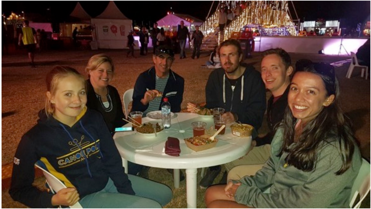
Enjoying some carb loading at the Night Noodle Markets

New Zealand has a strong history at recent World Championships, including a 2016 Gold and 2018 Bronze for the Women's and Under 21 Women's teams respectively, making the Women's division particularly competitive. NSW was able to field a Women's Team for the first time in several years, meaning the division was at a peak, with SA, ACT, NSW, QLD and VIC all participating. Our ACT Women were able to maintain their history of strong results with a second placing among the Australian teams, and fourth behind NZ Women (#1) and NZ U21 Women (#3).